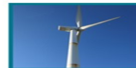
End of Life